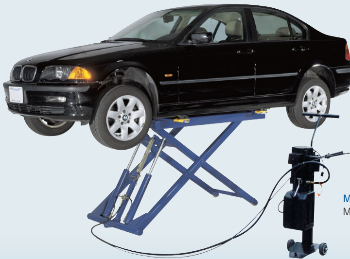
MR6K-48 Mid-rise lift

Mid-rise models lift cars, vans and light-duty trucks. They are ideal for tire, wheel and brake related repairs, collision repair work and new car preparation.